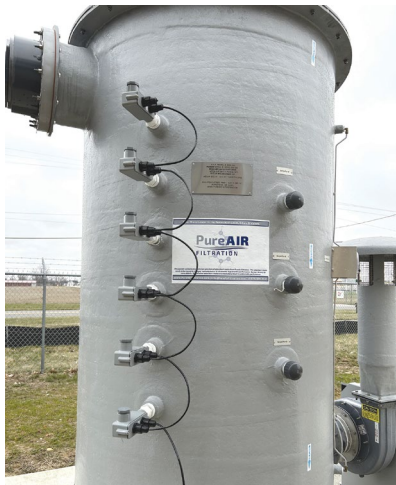
EGS-150 with LIFEGARD™ Media Bed Monitor