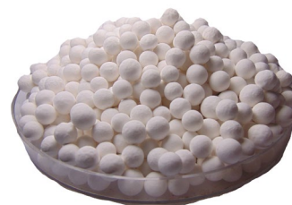
Safetysorb Adsorbent Media